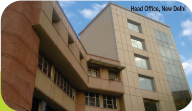
Head Office, New Delhi