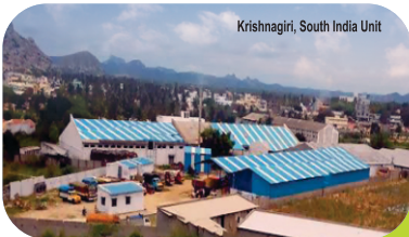
Krishnagiri, South India Unit